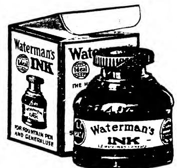
No. 104, 4 oz. Blue Black

No. 102 No. 202 No. 302 No. 502 No. 602 No. 702 Blue Black Green Violet Red Blue Jet Black